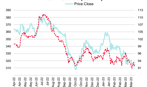
Siam Cement (SCC TB)